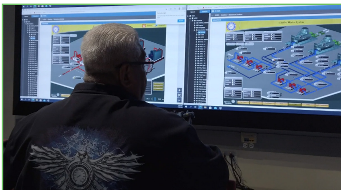
IUOE Training center

IUOE stationary engineers are expected to continually evolve and improve their skill sets to remain valuable and productive workers in the job market. It is therefore the IUOE's responsibility to train and prepare its members for these rapidly developing technologies and the ever-evolving job market. To achieve these goals, IUOE owns and operates its International Training and Educational Center in Texas. This state-of-the-art facility contains everything needed to host, support, and develop the skills of a constantly expanding and varied group of construction and maintenance professionals. Offering the following amenities, a visit to the ITEC facility encompasses