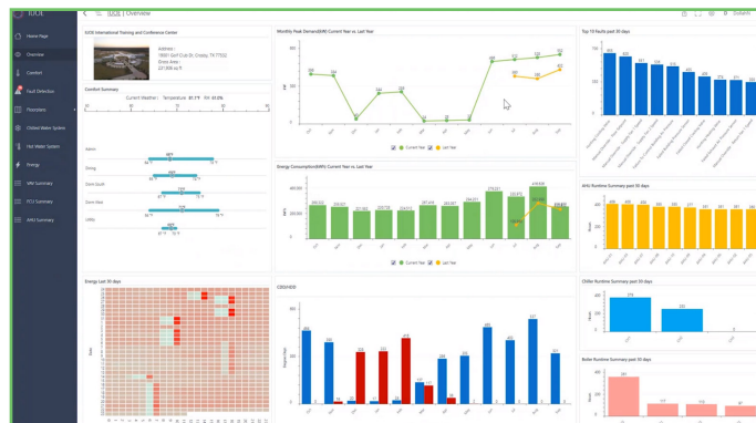
IUOE overview dashboard